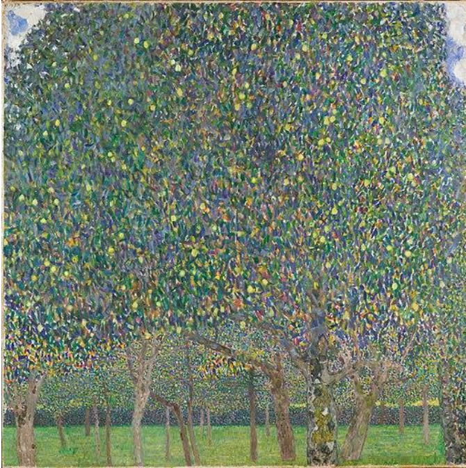
Pear Tree, Gustav Klimt

St Bartholomew's Episcopal Church 9 AM Sunday