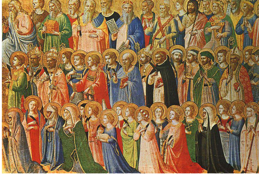
The Forerunners of Christ with Saints and Martyrs, Fra Angelico

St. Bartholomew's Episcopal Church Yarmouth, Maine