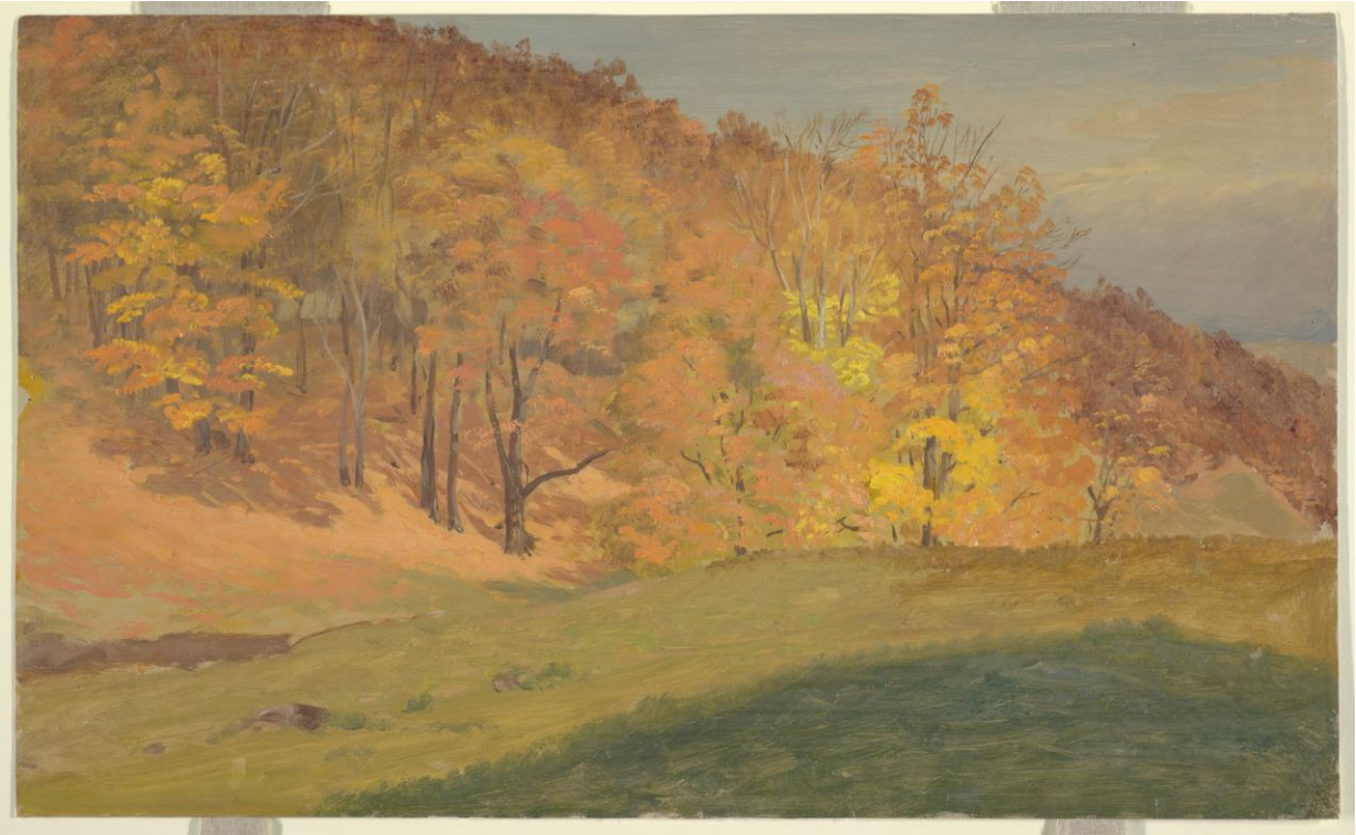
Autumn Woods, Frederic Edwin Church

St. Bartholomew's Episcopal Church Yarmouth, ME