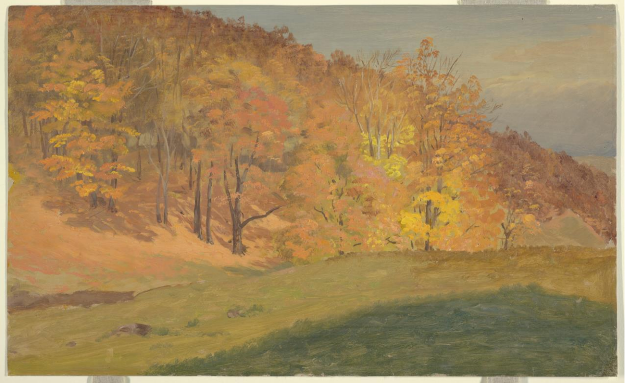
Autumn Woods, Frederic Edwin Church