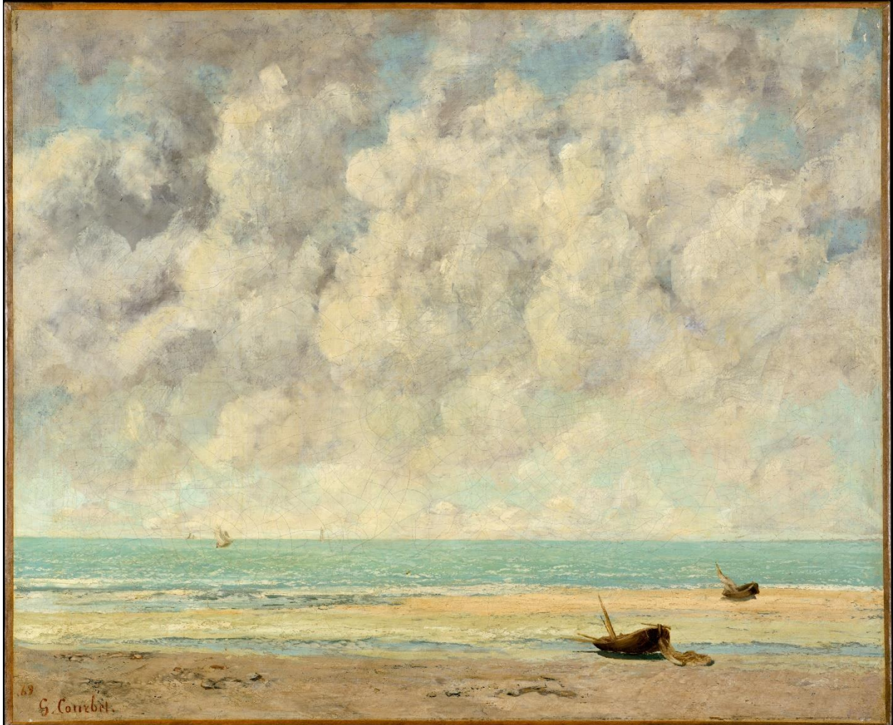
"Calm Sea" by Gustave Courbet

St. Bartholomew's Episcopal Church Yarmouth, ME