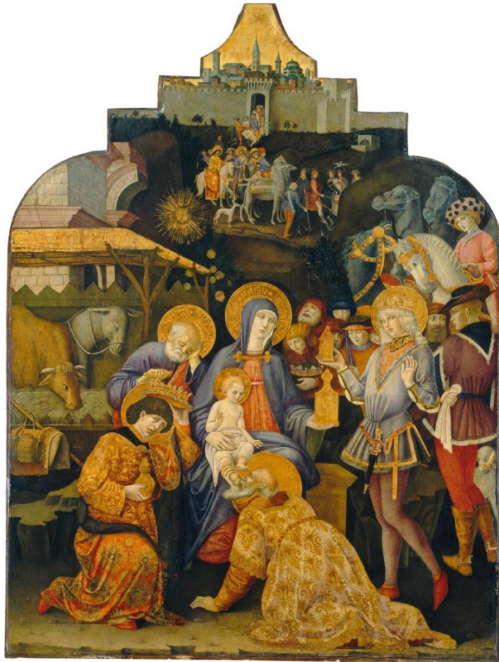
The Adoration of the Magi by Benvenuto di Giovanni

St. Bartholomew's Episcopal Church Yarmouth, Maine