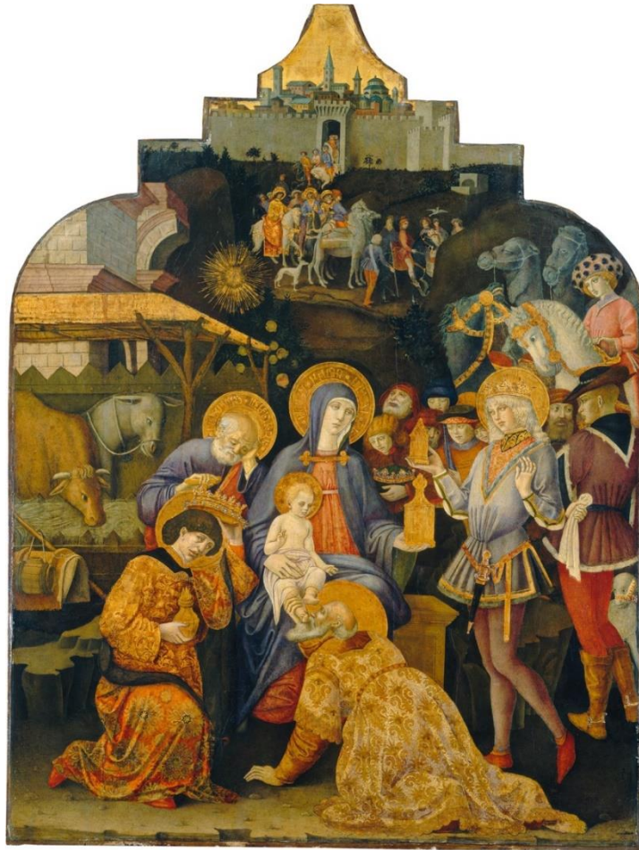
The Adoration of the Magi by Benvenuto di Giovanni

St. Bartholomew's Episcopal Church Yarmouth, Maine