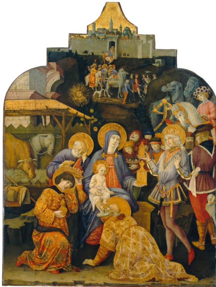
The Adoration of the Magi by Benvenuto di Giovanni

St. Bartholomew's Episcopal Church Yarmouth, Maine