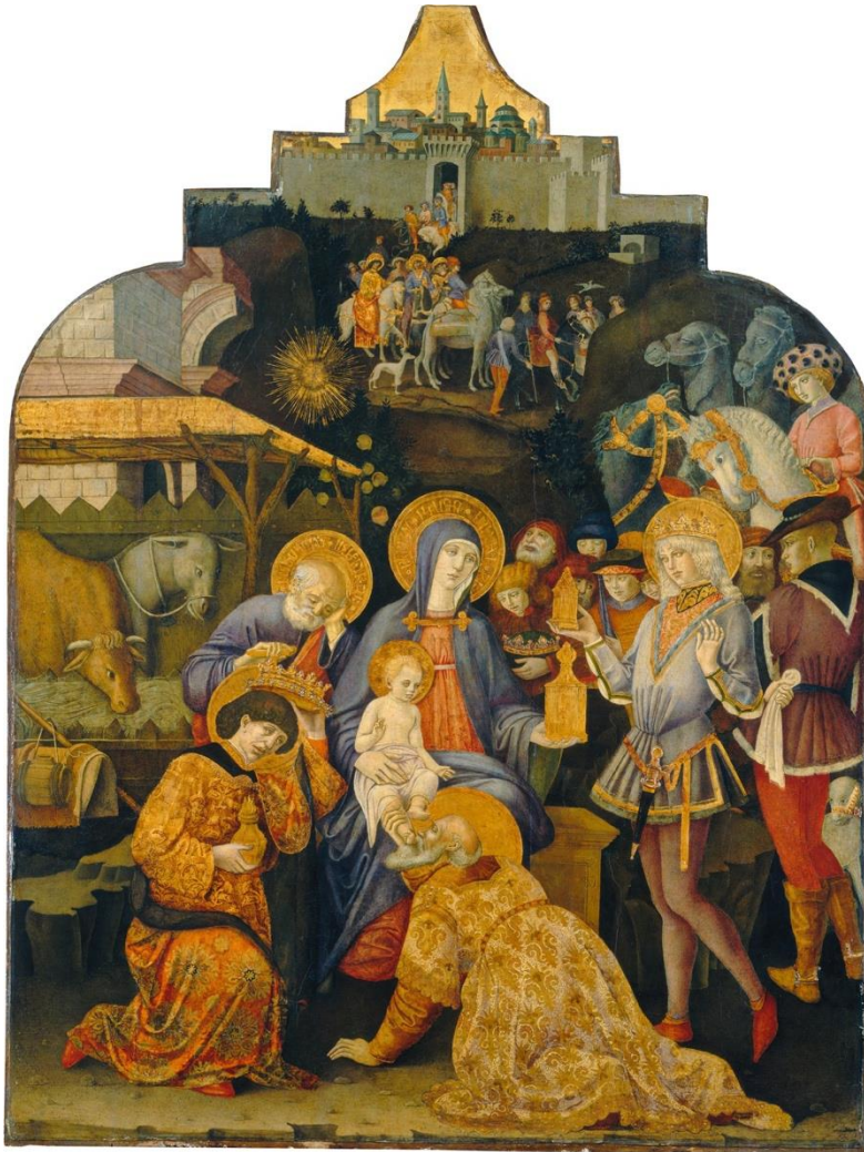
The Adoration of the Magi by Benvenuto di Giovanni

St. Bartholomew's Episcopal Church Yarmouth, Maine