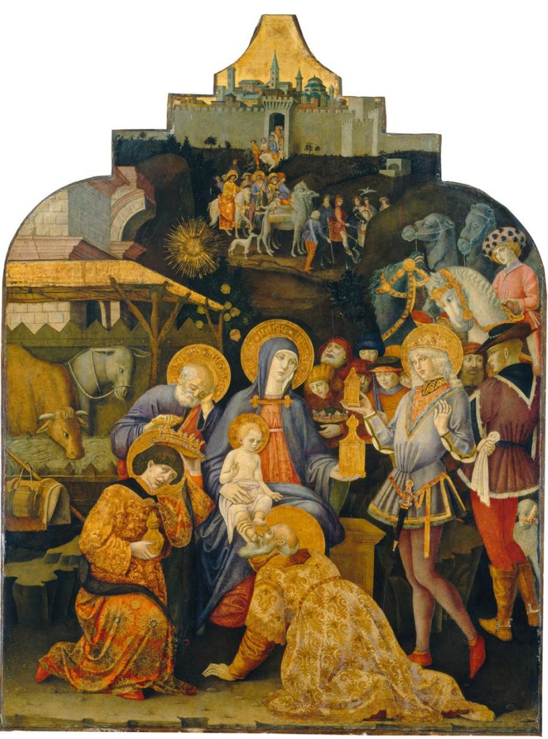
The Adoration of the Magi by Benvenuto di Giovanni